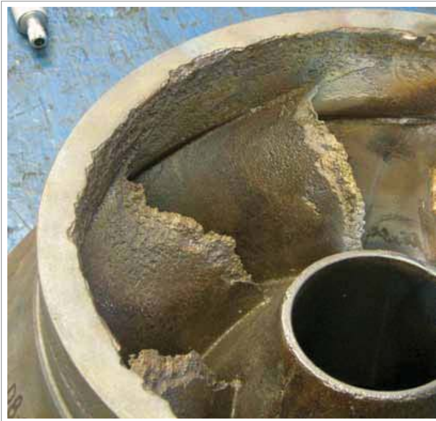
FIGURE 1 – Cavitation damage on a bronze impeller

Figure 2 shows a set of vibration plots for a large variable speed sewage pump installed at the City of Brockville, Pump Tag P2.